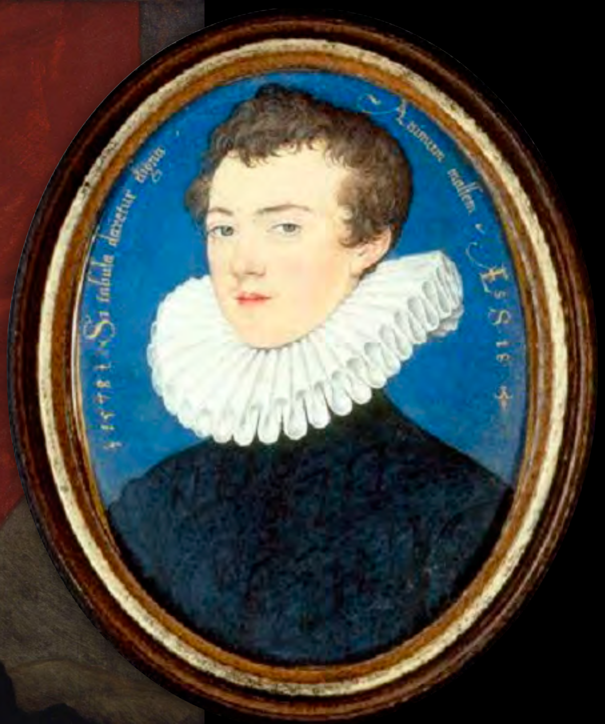
FRANCISCUS BACO DE VERULAMIO