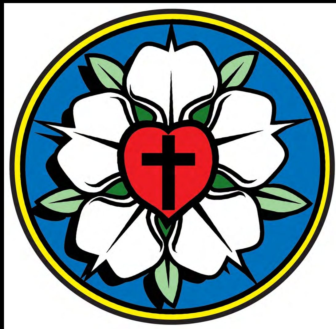
Martin Luther's Rose